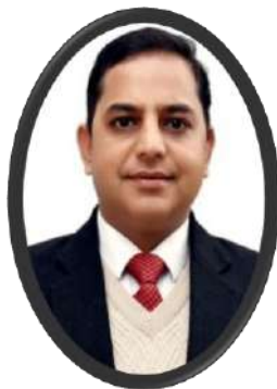
STUTI Coordinator-PMU Panjab University Chandigarh