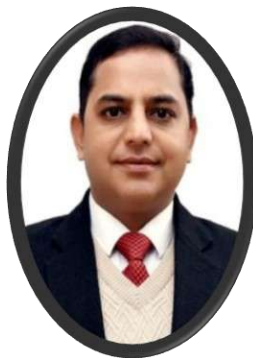
STUTI Coordinator-PMU Panjab University Chandigarh